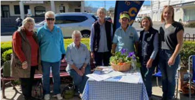
Gloucester Evening Branch held a stall in main Street of Gloucester to help promote Awareness Week. Members gave away Seasonal Eating cards and the display of seasonal fruit and vegetables helped create interest in this year's theme.