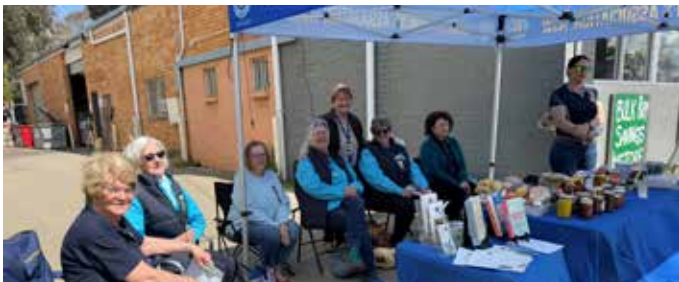
Armidale Branch members were available to discuss all things associated with Awareness Week at their pop up stand at Armidale Market Fresh. There was taste testing and the branch gave away a seasonal box of produce as well as promoting ways to reduce food waste. Jams, relishes, sauces, pickles and chutneys were on sale and showcased how to turn excess seasonal produce into delicious preserves.