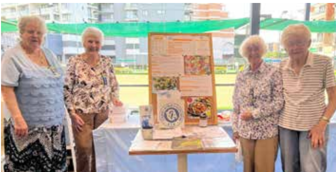
Terrigal Branch took a great lunch time opportunity to share CWA and this years Awareness theme with our local bowling community. Members gave away seasonal eating cards as well as selling craft and tasty treats.