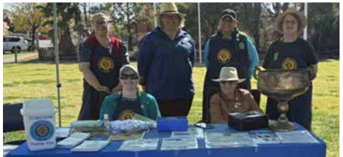
Condobolin Branch held an Awareness Week event with informational posters on seasonal vegetables and reusable kitchen scraps. There was also had information on hand for the CWA education grants and information on becoming a member of the CWA.