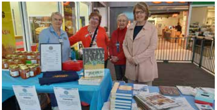
Belconnen Branch held a street stall where they displayed information about seasonal eating, and sold CWA cookbooks, CWA tea towels and beautiful homemade jam. There was much interest and support from the community.