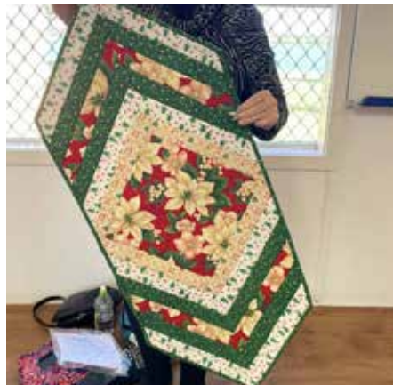
A quilt-as-you-go table runner from the recent handicraft workshop