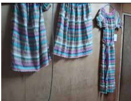
Material Aid recipients opening their parcel and dresses made from a Material Aid parcel.